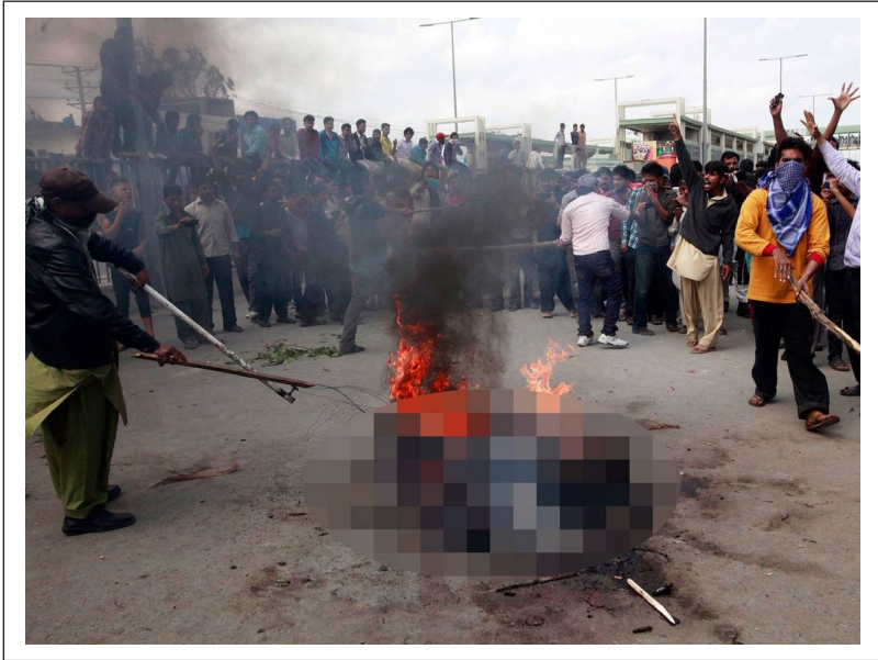
Figure 2. Bodily alignment in a vigilante ritual: Punishment of the offender.

Notes: An aligned audience has formed a circle, focusing on perpetrators. Caption taken from the source: 'Enraged Christian residents burn men they suspected of being involved in bomb attacks on churches, after lynching them in Lahore Pakistan'.