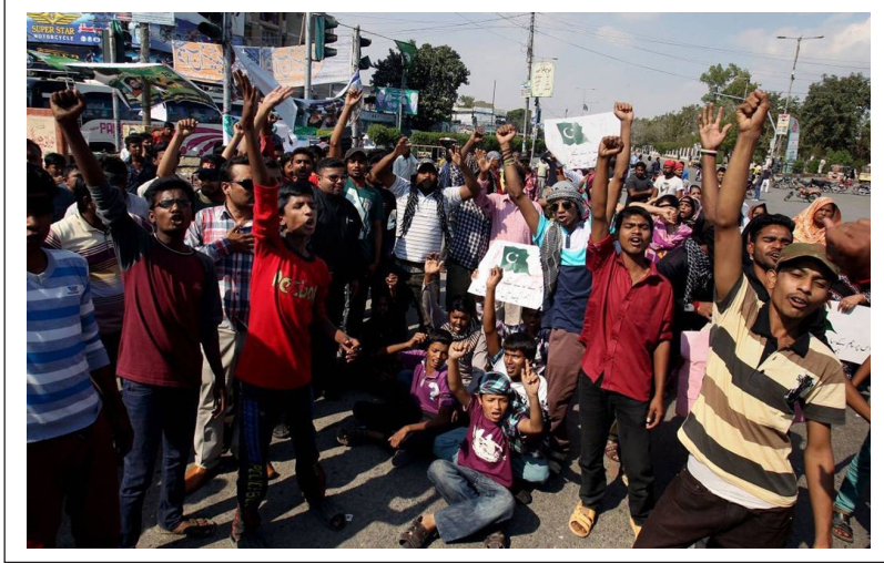
Figure 1. Bodily alignment in a vigilante ritual: Mobilization of a group.

Notes: Participants synchronizing their bodies in a vigilante ritual prior to the lynching. Caption taken from the source: 'Pakistani Christians chant slogans during a demonstration to condemn the suicide bombing attack on two churches, Sunday, March 15, 2015 in Karachi, Pakistan'.